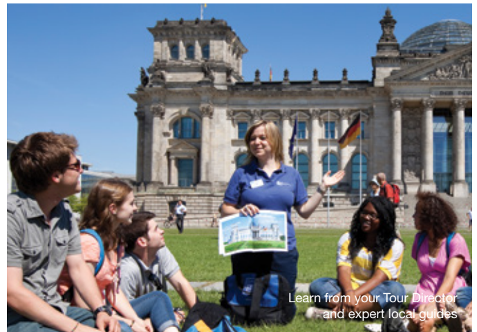
Learn from your Tour Director and expert local guides