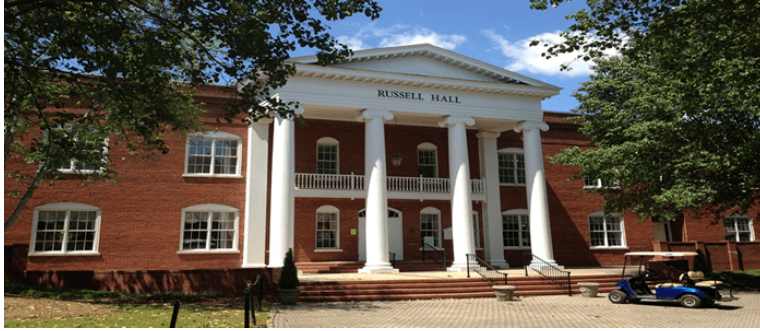
1964 - Present Russell Hall as it Looks Today