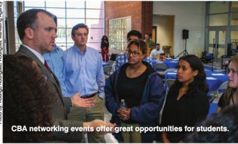
CBA networking events offer great opportunities for students.