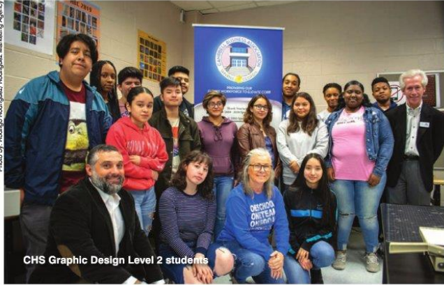
CHS Graphic Design Level 2 students