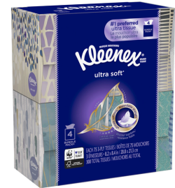
2 Box of tissues