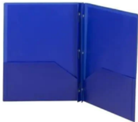
2 Plastic pocket folders