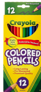
1 Box colored pencils 12 count (Crayola preferred)