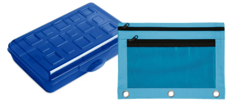
1 Pencil pouch/bag/box