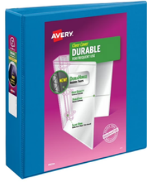
1 Binder (2" or 3")