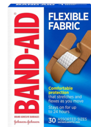
1 Box of band aids