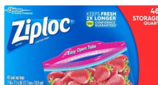
1 Box quart size Ziploc bags