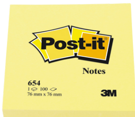
3 Packs of sticky notes