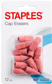
1 Pack of erasers