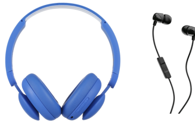
1 Pair headphones or earbuds