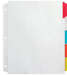
1 Pack binder tabs 5 tab/subject with pockets preferred