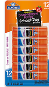
12 Glue sticks