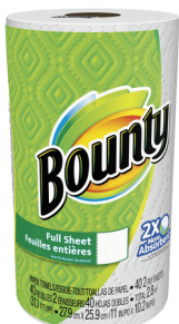
1 Roll paper towels