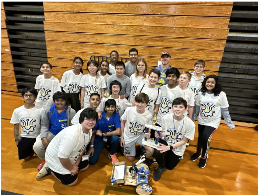
Around The Campus