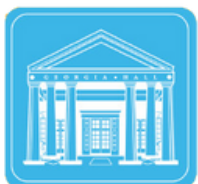
ROOSEVELT WARM SPRINGS