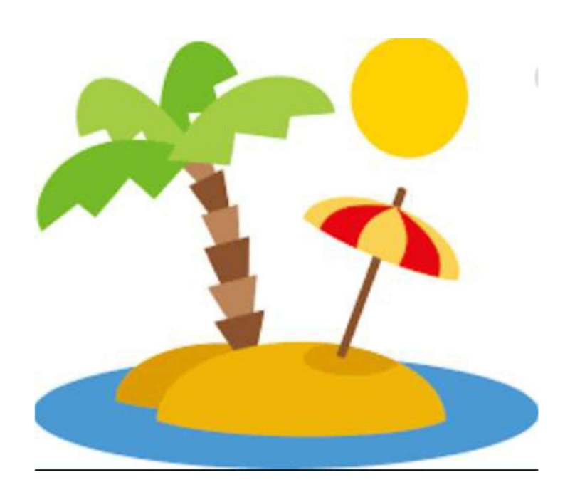
Have a great summer!

When you are finished, you may use the following website to preview our 1st few units in math 7: https://gavirtual.instructure.com/courses/34330