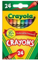
1 box of Crayola crayons