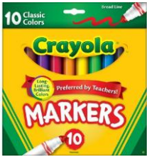
2 boxes of Crayola markers

Please provide the following supplies to be used at school. Please DO NOT label the supplies.