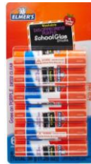
3 5-packs of glue sticks