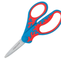
1 pair of scissors