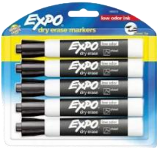
2 5-packs of Expo markers