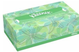
4 boxes of tissues