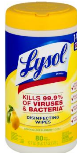
2 Lysol Wipes