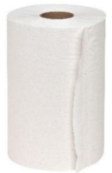
1 rolls of paper towels