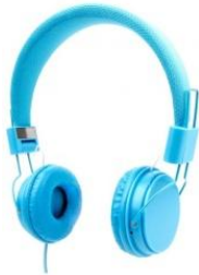
1 pair of headphones (Please put Your child's name on these)