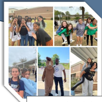
DARE Day this Friday!

A trendsetter who is not afraid to walk a new path. A Maverick leads others by encouraging excellence , enthusiasm , and ingenuity .