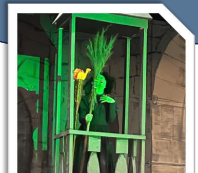
This week's performances of The Wizard of Oz were amazing!

A trendsetter who is not afraid to walk a new path. A Maverick leads others by encouraging excellence , enthusiasm , and ingenuity .