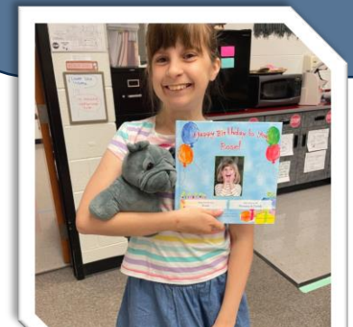
Spirit days were fun this week. Kindergarten Day for the win!

A trendsetter who is not afraid to walk a new path. A Maverick leads others by encouraging excellence , enthusiasm , and ingenuity .